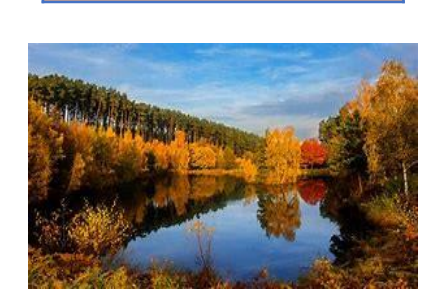
Cannock chase throughout the seasons. Spot the difference.